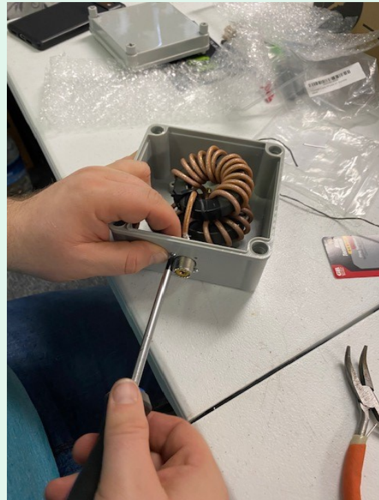
The final touches on a choke