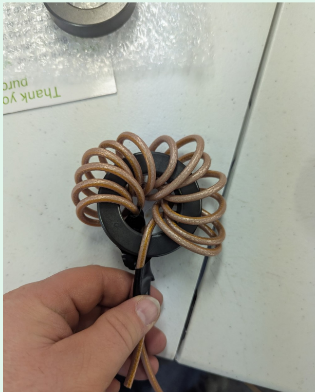
Wrapping the toroid