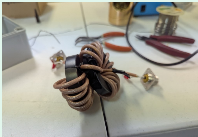
Soldering the connector