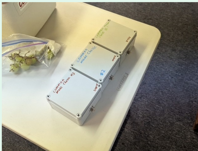
3 chokes ready for testing

How did the FT8 fun station do? It made over 200 contacts between Saturday and Sunday. After operating in the contest, the quiet of the FT8 fun station seemed to be a nice respite from the noise of the SSB Contest.