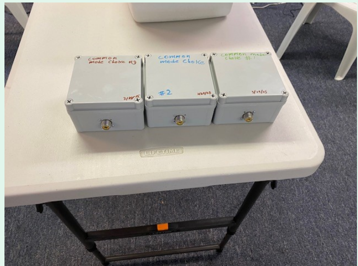
The first three