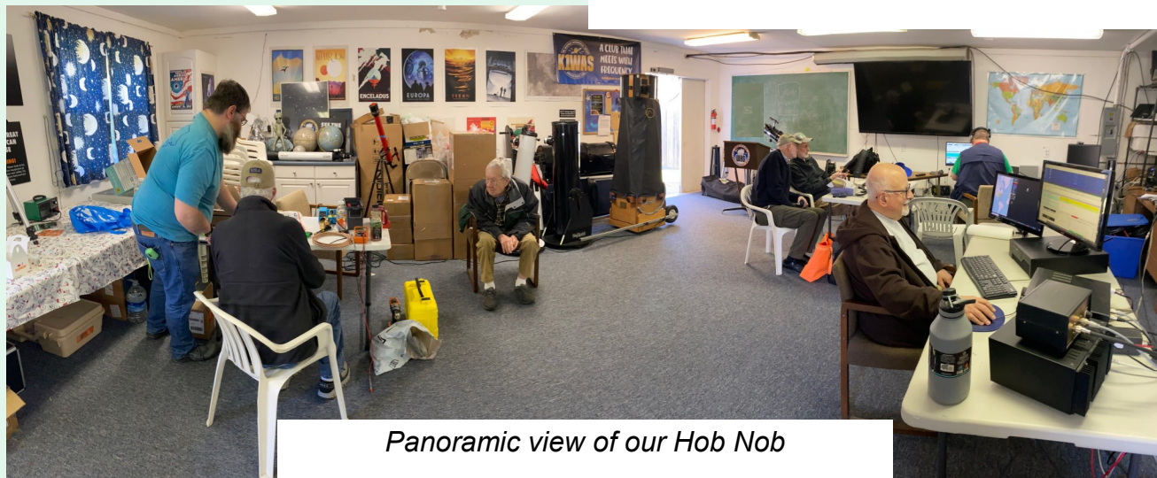
Panoramic view of our Hob Nob